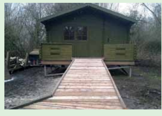
PAUL CLAYDON RANGER

■ It's done - almost! We need to tar-and-chip the boardwalk extension and complete the fit out.