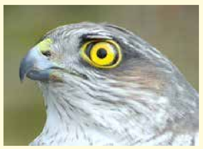
Female Sparrow Hawk

We had a successful year catching birds on Holt Island. We visited 17 times catching 984 birds of which 415 were newly ringed, 550 were re-trapped and 16 were young in nest boxes. In all we caught 26 species. The most spectacular was a female Sparrow Hawk with incredibly sharp talons.