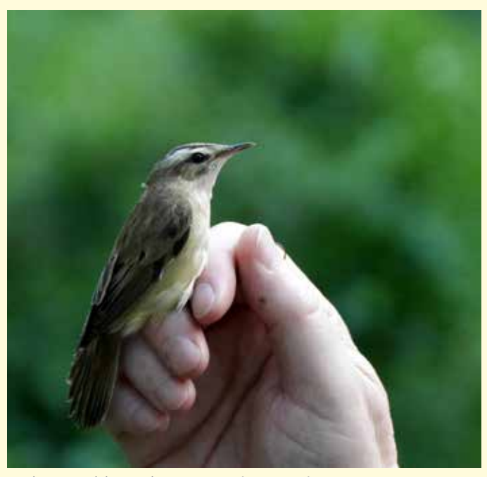
Sedge Warbler

The Warblers had a poor to average year partly because the main reed bed suffered early in the year and had very few flowers and there was an invasion of goose grass that swamped parts of the reed bed. But we did have Sedge Warblers present which is the first time for about four years, three were ringed.