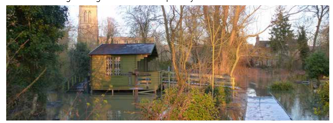
The Holt during the flood

The big news for this season is the weather! We have had snow, flooding and extreme winds so far, challenging for wildlife and people. The bird feeders on the island are literally life savers in these conditions, and our volunteers continue to keep them topped up regularly. We were worried that the badgers in their underground sett would be badly affected by the flooding, but happily they have been seen since the water went down, very busy and very muddy. The female badger (sow) gives birth in February, so we are hopeful that the activity is in preparation for a new litter. We will be using the night camera to keep an eye on the sett.