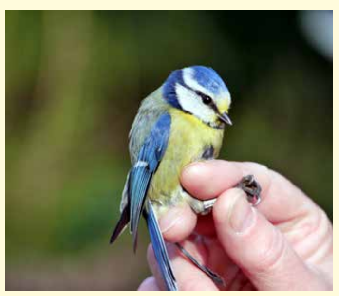
Blue Tit with yellow face

The Great Tits had a poor year in 2016 when we ringed 64 new birds, but in 2017 we had a fifty percent increase in new birds ringed at 97. This seems to be partly due to an influx of birds from the Golf Course area which is being redeveloped and had at least temporarily pushed the birds out.