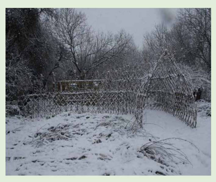
Willow Tunnel in the snow

Due to the success of the willow tunnel we are looking at adding a new section of willow wall along the grass path by the backwater this winter.