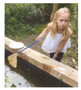
Alice...where next?