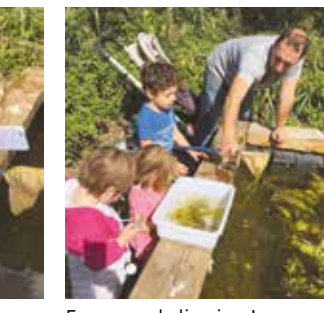
Fun pond dipping!