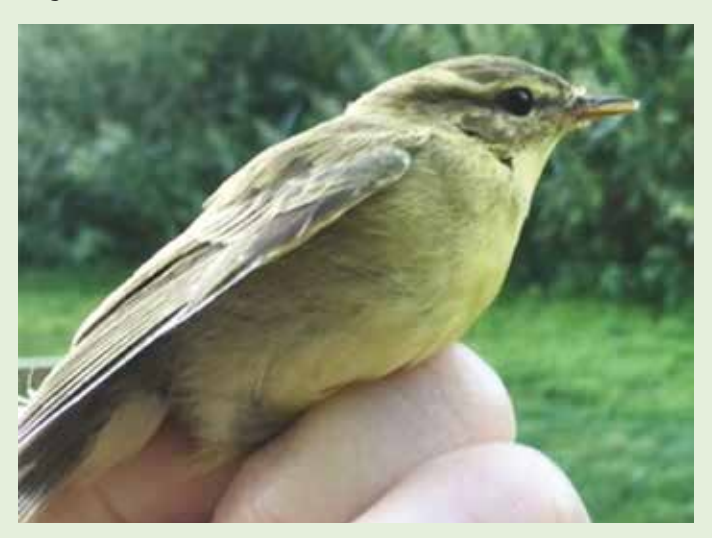
Juvenile Willow Warbler

Sedge Warblers bred again in small numbers on the Island, they have been absent for several years. Ten new birds were caught including 5 juveniles, but all lef in midaugust.