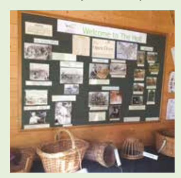
Holt Display.