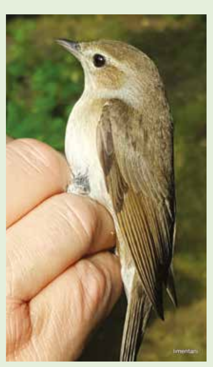
Juvenile Garden Warbler