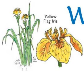
Yellow Flag Iris