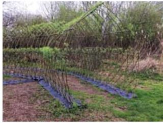
Willow Tunnel leading to the Bird-feeding Station (Ian Jackson)

We can offer educational visits, an outdoor classroom (The Holt), talks and walks. An Education Pack DVD is available for teachers.